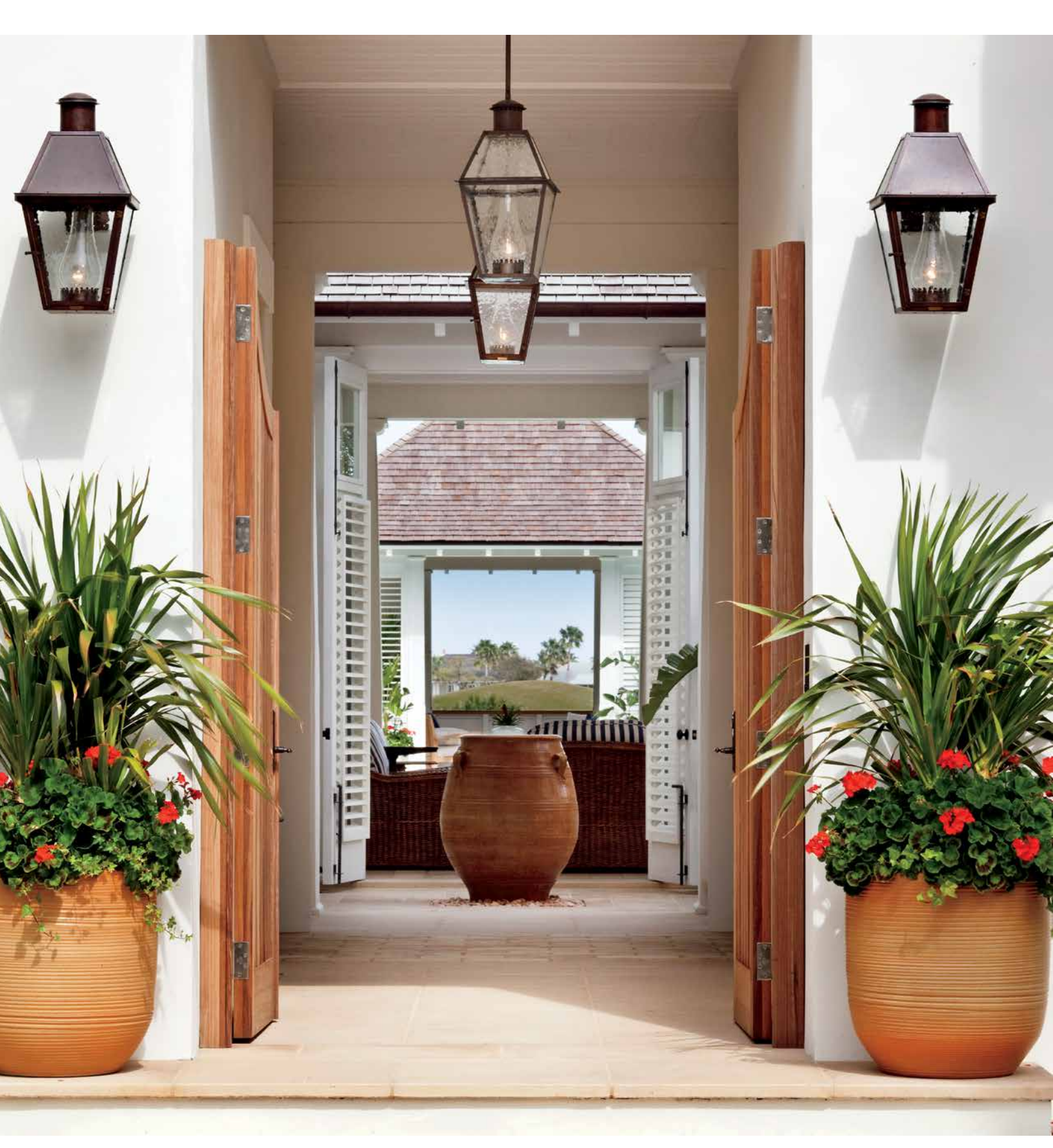
Salt air quickly corrodes exterior lights and wiring as well as door hardware if they are not properly and regularly maintained. Once the fixtures and wiring are corroded, replacement can be costly.