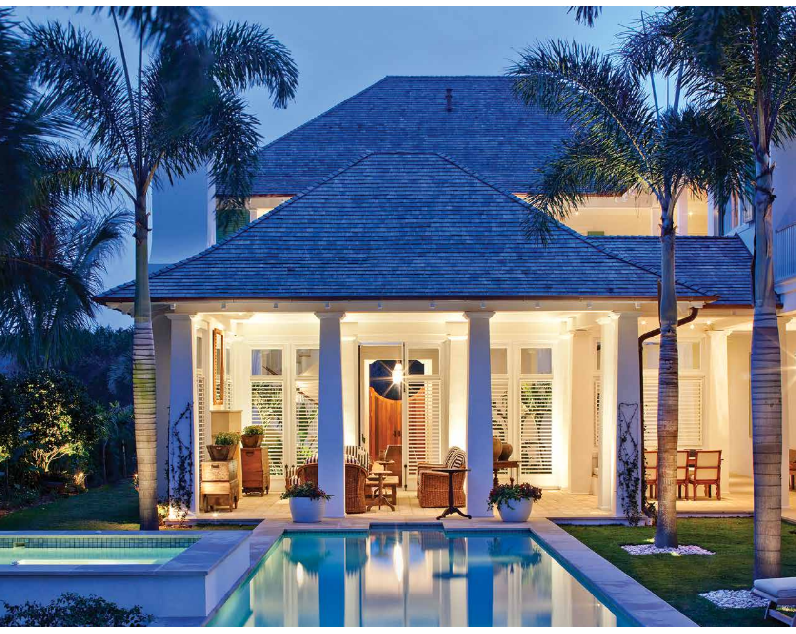
As part of their maintenance and monitoring services, Whitehall inspects roofs, including chimneys, dormers and gables for cracking, checks for sliding and cracked roof tiles and inspects the flashing.

the owners want us to buy a live Christmas tree, light it up and string the outdoor lights, too. When the family comes in town for that week, they have a welcoming treat in store," Jones says. "The children love it."