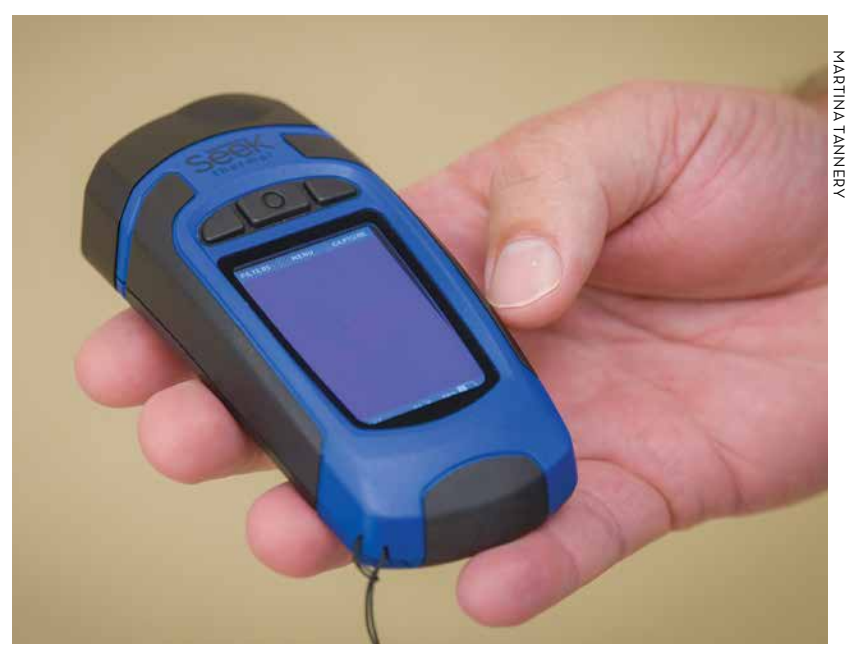
Tools like a thermal camera make a property manager's job easier. This one enabled members of Whitehall's team to find a water leak behind sprayed insulation in an attic.

"We take care of one home that was built about 10 years ago, at the same time as the next-door neighbor's," says Shiflett. "The house we cared for was in good shape, but when we visited next door, we noted that all their exterior light fixtures were corroded and beyond repair, and the wiring was broken down. For our program, we take fixtures apart every year, pull bulbs,